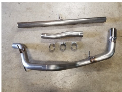
Part No. 92T105