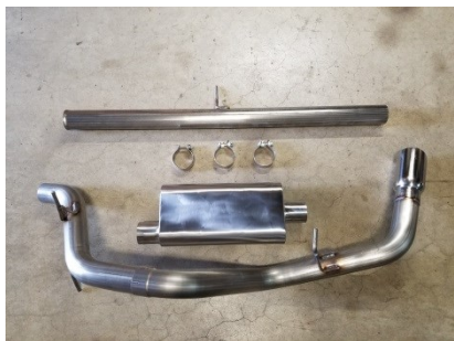
Part No. 92T110